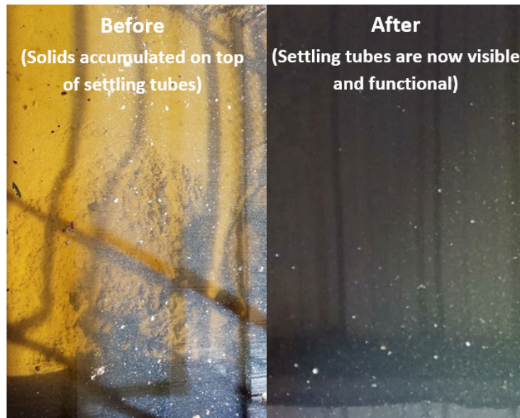
Figure 1: Settling tube before treatment (Left), settling tube after three (3) weeks of treatment (Right)