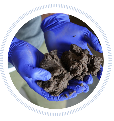
Figure 1. Dried sludge belt pressed and dumped out waste.

The Biotifx<sup>®</sup> ULTRA treatment started in the spring and continued for a period of 60 days. Each storage tank was dosed on a weekly basis (based on 24,400-gallon tanks). The volume and solids content of the sludge was monitored entering and leaving the sludge storage tanks. The facility's belt press was monitored for percent solids of pressed sludge and frequency of alarms due to changes and inconsistency in the sludge. The plant manager conducted odor surveys for baseline and treatment periods. Odor levels were ranked by the operator on a scale of 1–10, with 10 being the highest and 1 being the lowest. The odor survey was taken at the start, middle, and end of the pressing cycle.